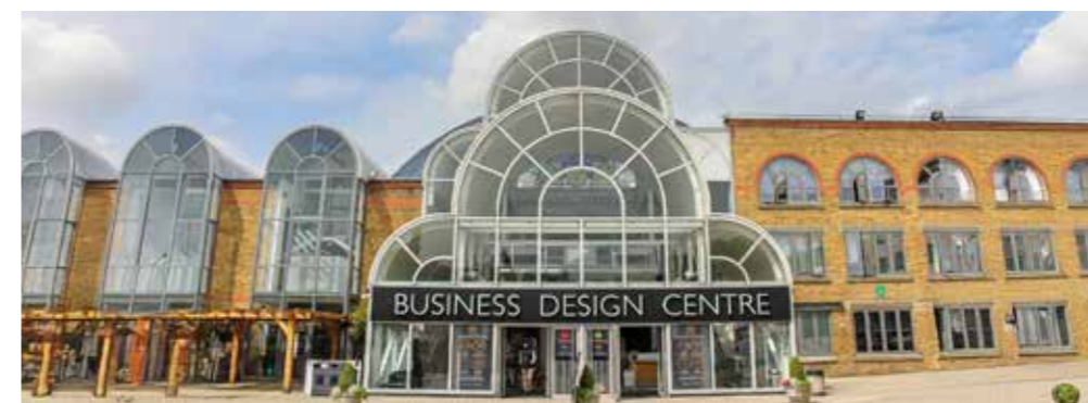
BUSINESS DESIGN CENTRE