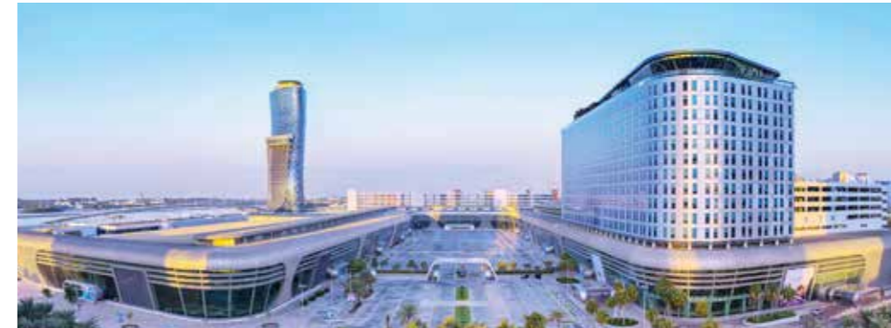
adnec centre abu dhabi مركز أدنيك أبوظبي

مراكز أدنيك في جميع أنحاء العالم ADNEC Group Centres Around the World