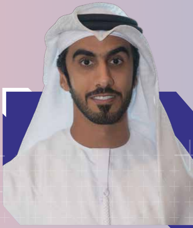
H.E. Mubarak Al Nakhi Undersecretary of the Ministry of Culture

These initiatives align with national priorities that position the creative economy at the forefront of the next phase of development, recognising its capacity to generate sustainable value. Fuelled by innovation, design, and technology, creative industries are well placed to expand and emerge as a key pillar of the knowledge-based economy. 'Make it in the Emirates' presents an enabling environment to integrate creative industries into the broader industrial ecosystem, strengthening their impact and opening new pathways for growth and investment. Through its participation, the Ministry of Culture reaffirms its commitment to supporting the creative sector and empowering professionals to translate ideas into productive ventures, contributing to the UAE's global competitiveness and reinforcing its standing as a hub for creativity.